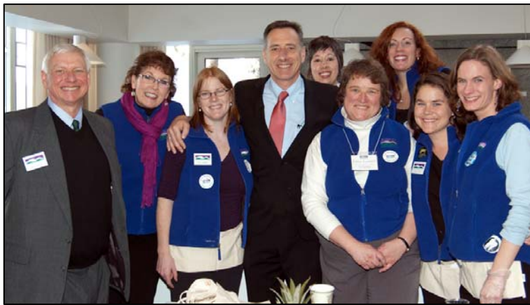
Governor Shumlin poses with the staff of Bi-State Primary Care Association at the Legislator's Reception in Montpelier.

MONTPELIER, VT -- Bi-State's annual Legislators Reception held at the VT State House on Feb. 10 drew a steady crowd of legislators. Bi-State Primary Care Association's newly published "Health Care for All in Vermont: Turning the Vision into Reality" was distributed to legislators. The booklet describes the existing multi-level, interactive system that has evolved in Vermont to provide and support the delivery of health care services to the residents of Vermont. The system of health centers, hospitals, educational